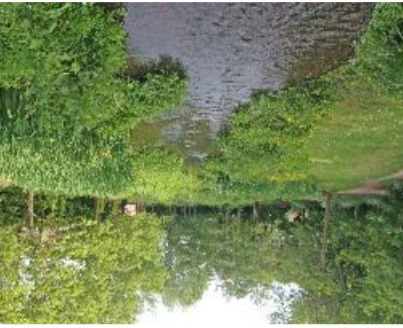
Meades Water Gardens

1, London Road Aylesbury Bucks HP7 0HE 01494 431431 www.foxsoutdoor.co.uk